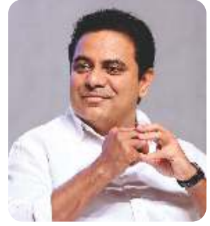
Sri K. Taraka Rama Rao

Hon'ble Minister for IT, Panchayat Raj, MA&UD Government of Telangana